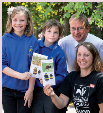
WESTERN POWER DISTRIBUTION

Companies such as Rolls-Royce, Bristol Water, Wessex Water and Western Power Distribution support our work. Initiatives include the award-winning Trout & About and Wild Schools Film Challenge, plus the Pollinator Project.