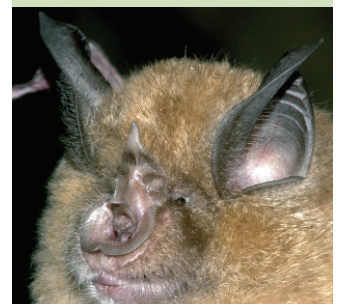
Grtr horseshoe bat