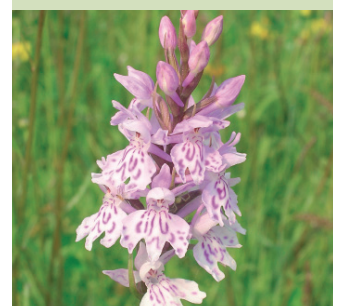
Common spotted orchid

This woodland is owned by our neighbouring Gloucestershire Wildlife Trust but jointly managed by both of us. It is a very large reserve with 23 woods and coppices separated by ancient grassy trenches and rides. Two clearly waymarked walks start from the Lodge.