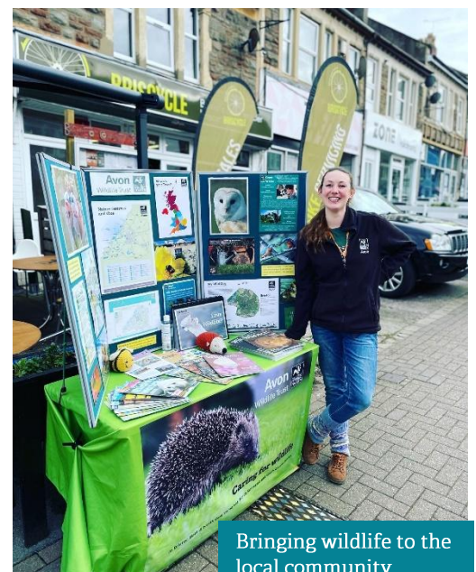
Bringing wildlife to the local community