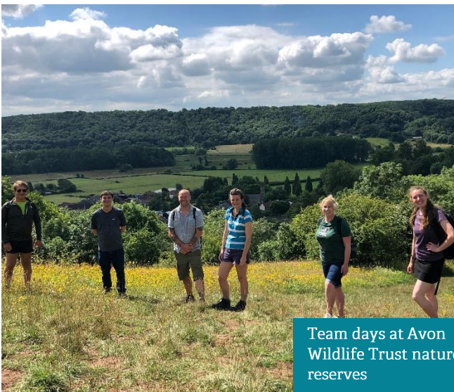
Team days at Avon Wildlife Trust nature reserves

We are wholly owned by Wildlife Trusts, working collaboratively as a specialist organisation to increase effectiveness, minimise costs and innovate successfully. We aspire to achieve this in an ethical way, characterised by high standards of personal and organisational conduct coupled with compliance with best fundraising practice. We are members of the Chartered Institute of Fundraising and work to a strict code of conduct.