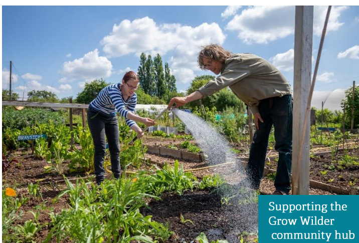
Supporting the Grow Wilder community hub