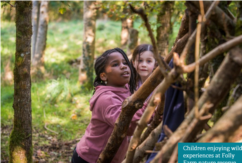
Children enjoying wild experiences at Folly Farm nature reserve